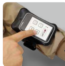
Sport-case for hand-held controls (product no. 5016)