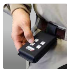
Case with belt loop for remote (product no. 4716)